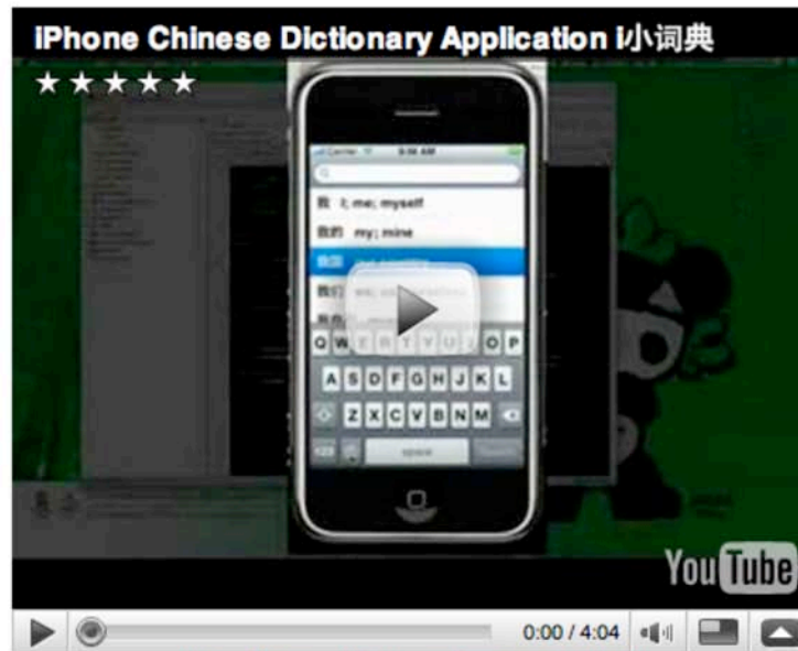
iPhone Chinese Dictionary Application 小词典

The first movie is the actual application. Which, by the way, is a Chinese / English dictionary that lets you search by Mandarin pinyin, English, or Simplified characters (also, 典 should have been third tone sorry :-/):